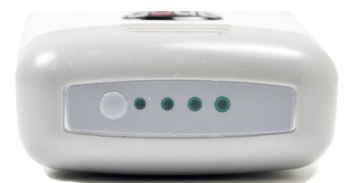
Battery status LED indicators with fuel gauge

With an aggressive scan engine, the CR2600 decodes bar codes faster and features patented technologies including dual field optics and glare reducing technology. The result is unequalled, unmatched bar code reading performance.